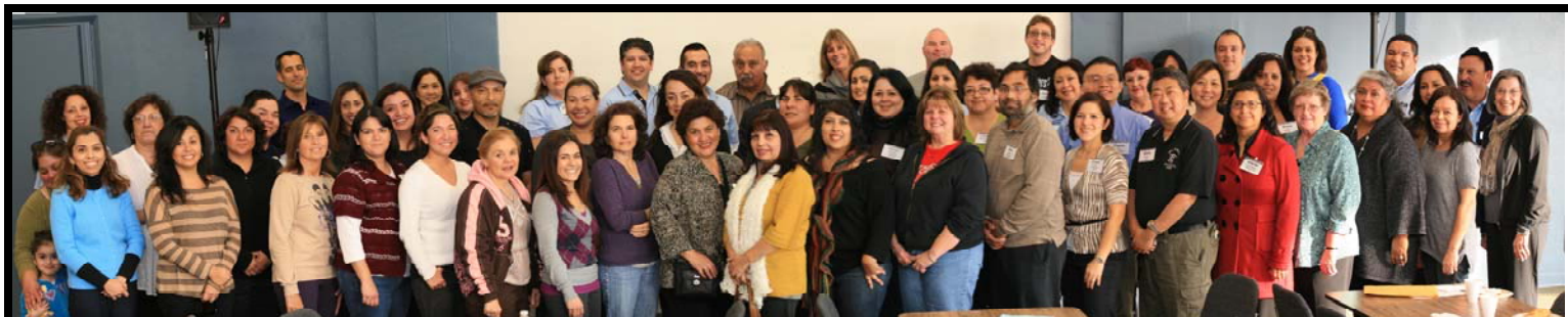
Council met for the first time at the Montebello Teachers Association Conference Center (MTA CC) Tuesday, January 24. The MTA CC is located at 920 Whittier Blvd. adjacent to the MTA Office. Council has found a new home! Everyone present for the beginning of the first historic meeting is pictured above.

Montebello Teachers Association/California Teachers Association/National Education Association • 918 W Whittier Blvd Montebello 90640 • (323) 722-5005 • montbelloteachers.org