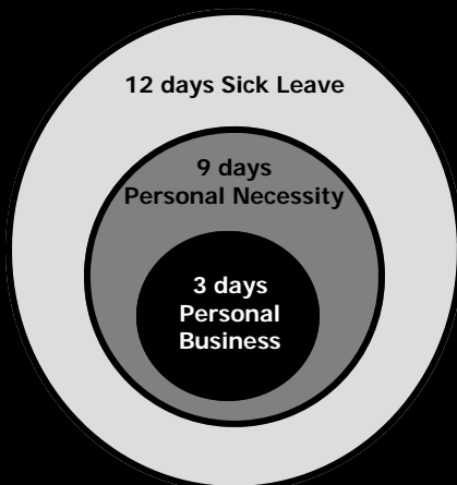
Venn Diagram Depicting Use of Current Sick Leave

The polls are open from 7 a.m. to 8 p.m. Tuesday, November 6.